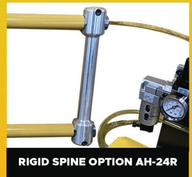
RIGID SPINE OPTION AH-24R