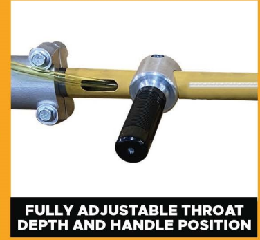
FULLY ADJUSTABLE THROAT DEPTH AND HANDLE POSITION