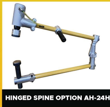
HINGED SPINE OPTION AH-24H