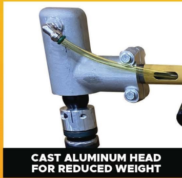
CAST ALUMINUM HEAD FOR REDUCED WEIGHT