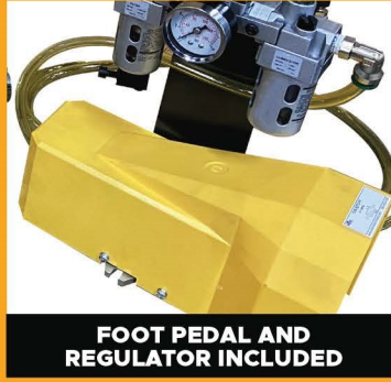
FOOT PEDAL AND REGULATOR INCLUDED