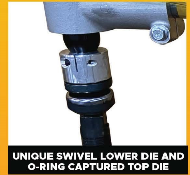
UNIQUE SWIVEL LOWER DIE AND O-RING CAPTURED TOP DIE